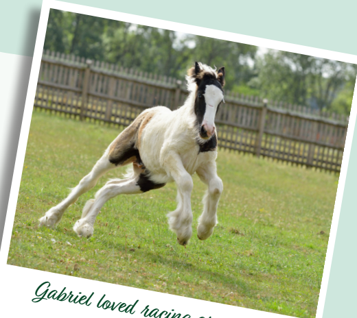
Gabriel loved racing around his paddock!

If you've already arranged your own place in an event, please let us know and join Team Horse Trust!