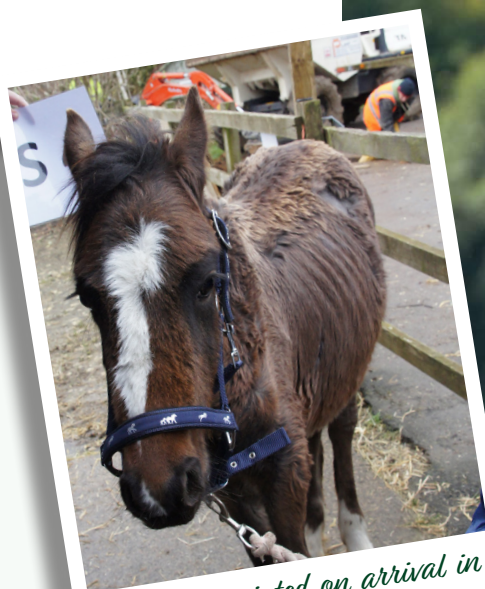
Jenga emaciated on arrival in 2012

"In his downtime, he loves hacking and is building confidence at hacking alone and taking the lead. We have done a sponsored ride round West Wycombe, and hope to do more over the next year."