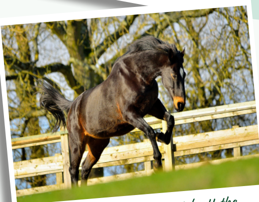
Old boy Belthorn is still quick off the mark!