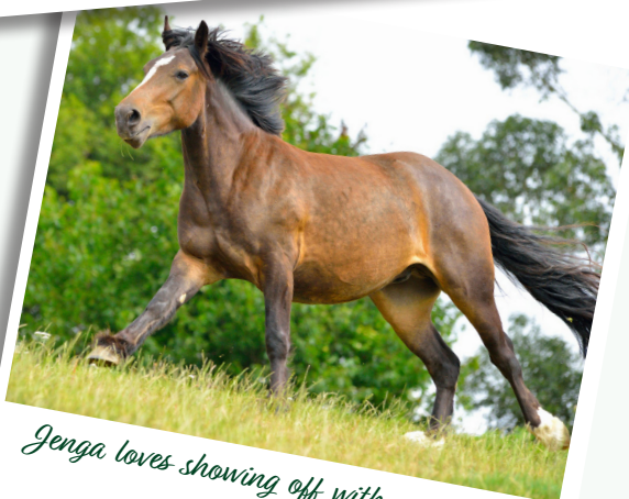
Jenga loves showing off with a sprint to the finish line