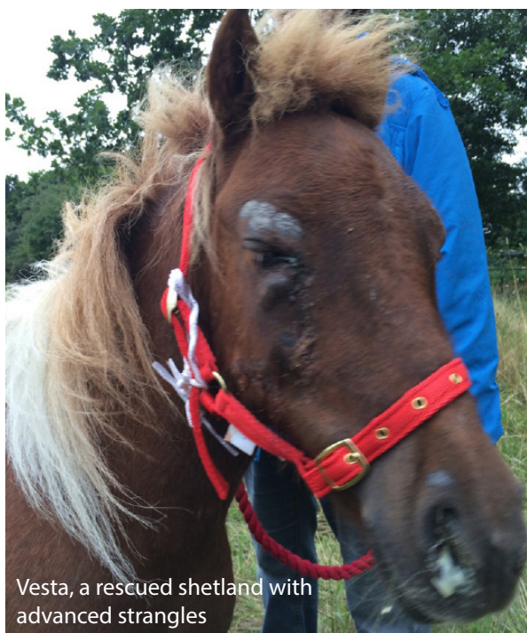
Vesta, a rescued shetland with advanced strangles